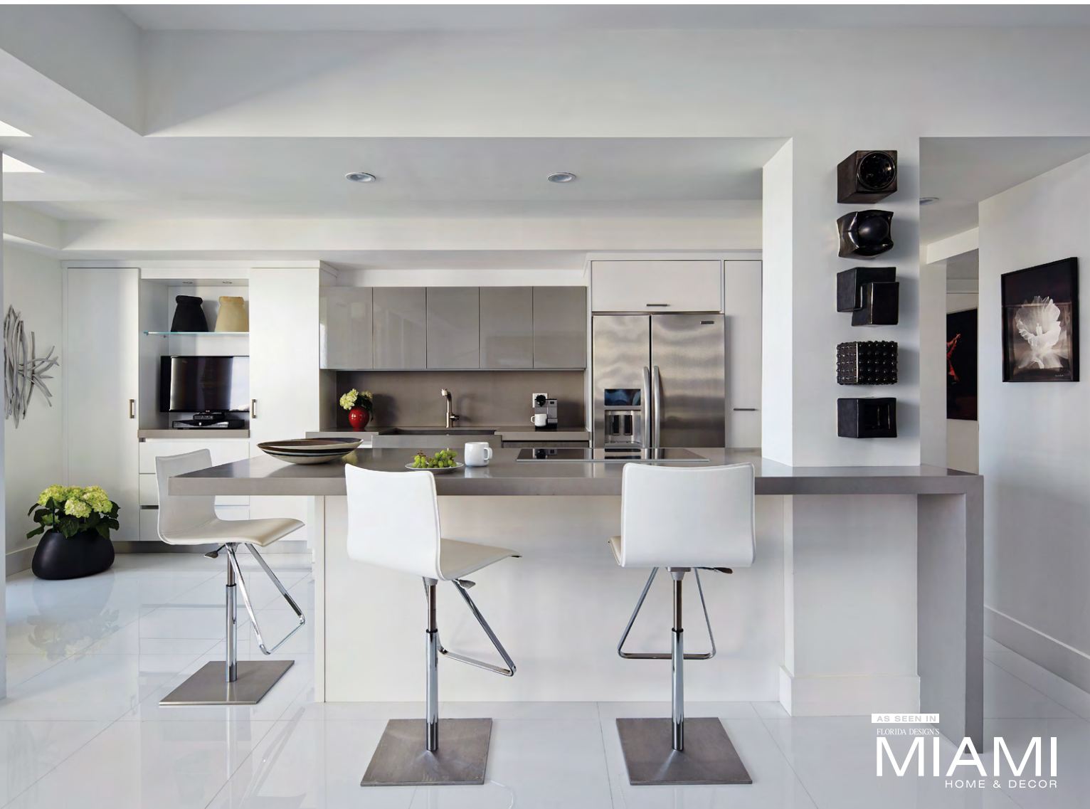
AS SEEN IN FLORIDA DESIGN'S MIAMI HOME & DECOR